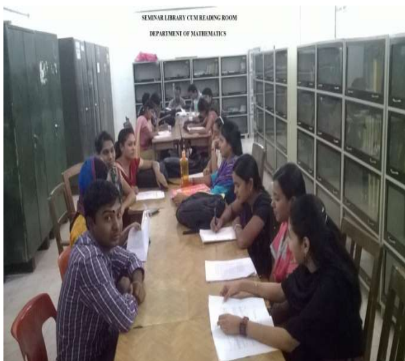
SEMINAR LIBRARY CUM READING ROOM, DEPARTMENT OF MATHEMATICS