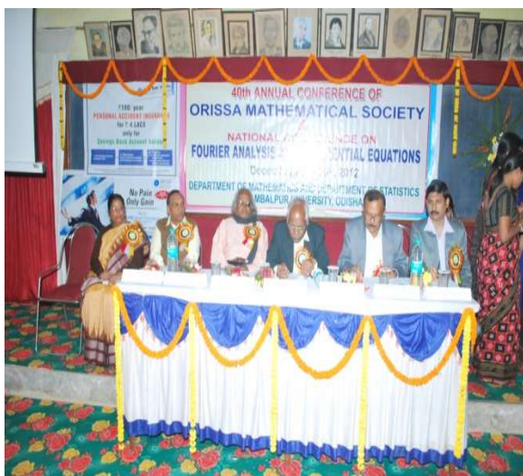
ANNUAL CONFERENCE OF OMS AND NATIONAL CONFERENCE ON “FOURIER ANALYSIS AND DIFFERENTIAL EQUATIONS, 2012”