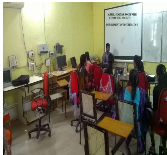
M.PHIL. SEMINAR ROOM WITH COMPUTING FACILITY, DEPARTMENT OF MATHEMATICS