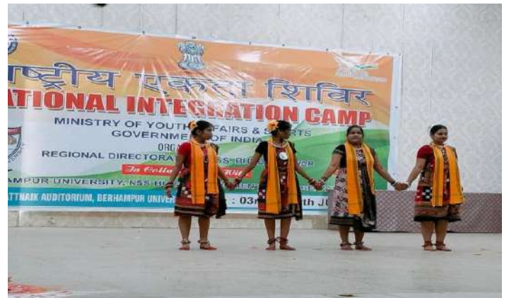
Volunteers participated in State Integration Camp