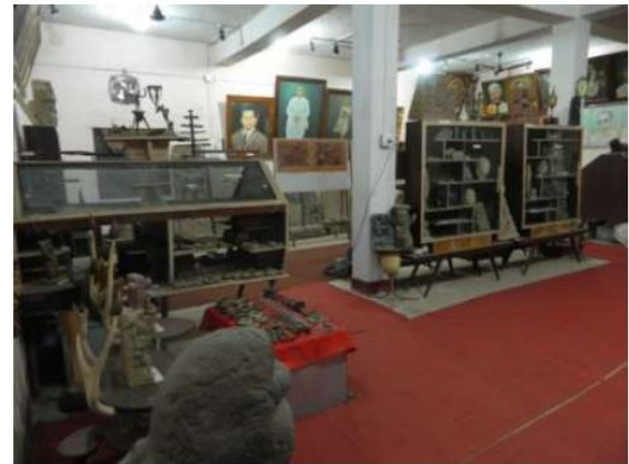
View of the Museum Hall