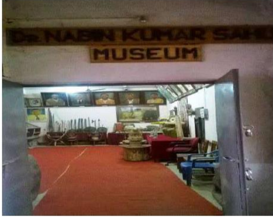
NK Sahu Museum