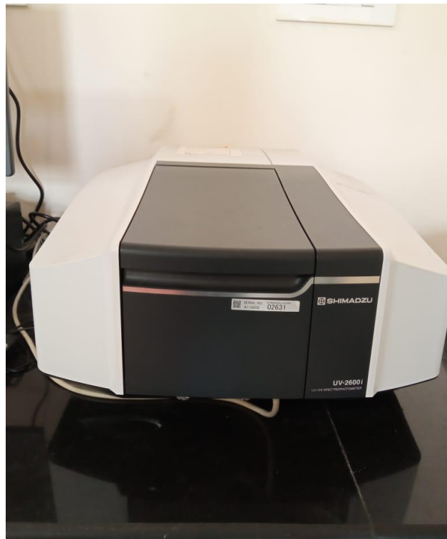
UV-VISIBLE Spectrophotometer with integrated sphere, Shimadzu